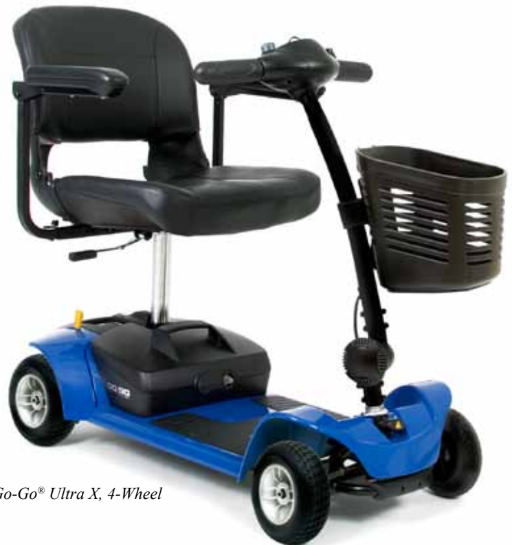
Go-Go ® Ultra X, 4-Wheel