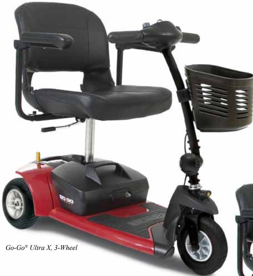
Go-Go ® Ultra X, 3-Wheel

The Go-Go ® Ultra X is loaded with design features like one-hand feather-touch disassembly and a convenient drop-in battery box that makes transport and travel worry free. The Go-Go ® Ultra X delivers these features and more, along with the performance you expect from the first name in travel mobility, making it the ultimate travel scooter value.