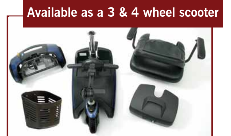
Go-Go Elite Traveller<sup>®</sup>, 3-wheel

The Go-Go Elite Traveller <sup>®</sup>'s compact design allows it to easily maneuver in tight spaces while providing stable outdoor performance. Take the guesswork out of travel with simple, one hand Feather-touch disassembly. Go where you want to go, easily, with the Go-Go Elite Traveller.